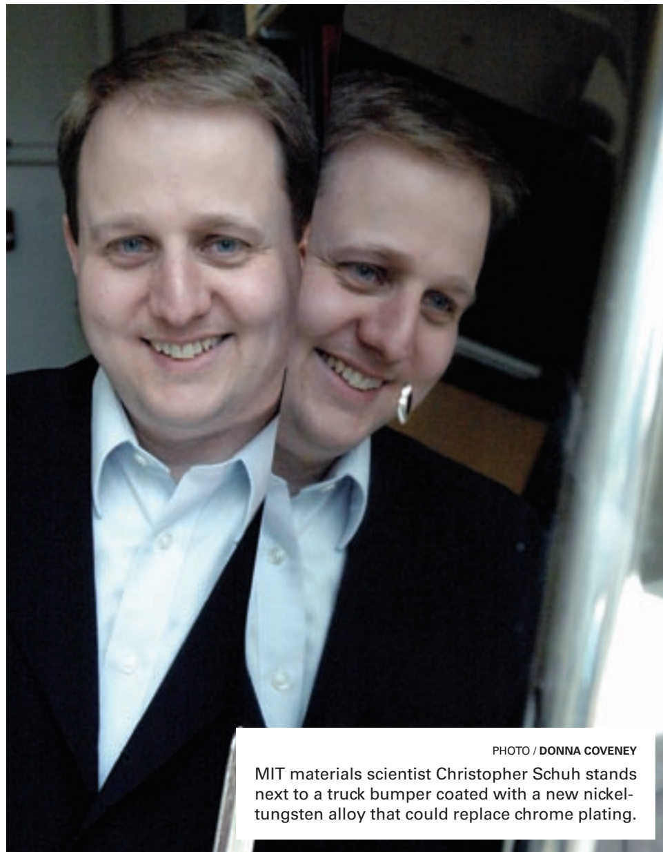
MIT materials scientist Christopher Schuh stands next to a truck bumper coated with a new nickel-tungsten alloy that could replace chrome plating.

Electroplating, the technique used to coat metal objects with chrome, involves running a current through a liquid bath of chromium ions, which deposits a thin layer of chrome on the surface of an object placed in the bath.